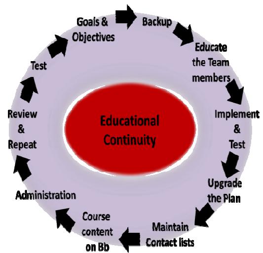
Figure 4: Model for Successful Educational Continuity

Step 7-Blackboard Course Upload: For colleges and universities, the DRP must necessitate updating all course content, syllabi, student-faculty contact information on Blackboard each semester, whether they are taught online or not. This helps the faculty and students to continue their work while going through a disaster. Alternatively, an inexpensive piece of backup media such as a writable CD could mean the difference between business disaster and business survival. Depending on the amount of critical information one needs to protect, there is a wide array of affordable media available such as flash drive, floppy disk etc.