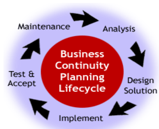
Figure 2: Business Continuity Planning Lifecycle

In 2006, a Computer World survey of small businesses with 1,499 employees or fewer indicated that 50% of these businesses had no DRPs, with 8% having no plan to set any DRP up (ComputerWorld, 2006). An organization's survival and recovery from a disaster, however, is dependent on a well structured DRP. This is as true for a business with 500 employees as it is for a university which may have as many employees and four to five times as many students, and must store important data such as student registration records, fee bills, attendance, payroll, courses, projects, inventory resources, etc