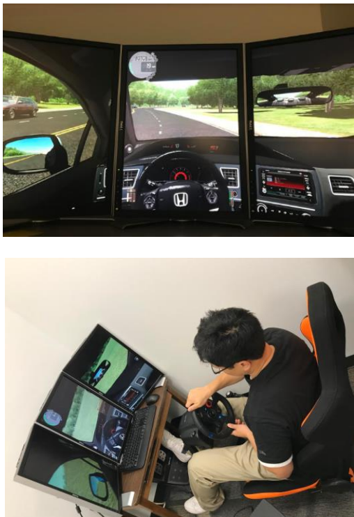
Figure 1. Driving Simulator

Before the experiment, a pilot test was administered to detect potential issues in the experiment design with six subjects. Based on the pilot test, we revised the experiment's design in terms of session time, driving difficulty, driving environment (e.g., town or highway), weather, vehicle types (e.g., sedan or SUV), and traffic conditions. The experiment is composed of five sessions with the four mobile distractions (i.e., stimulus) in the hypotheses and one session without distractions in order to measure the impact of mobile distractions on driving